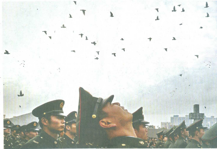
A fly-past by pigeons distracts an officer during a memorial ceremony in Nanjing (南京), Jiangsu (江苏), yesterday for the